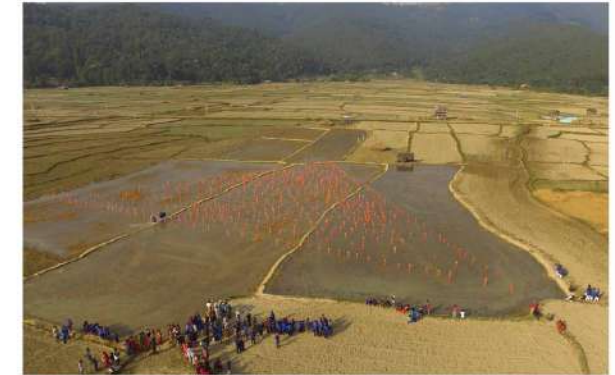
TALE PROJECT 2016 [DAKANI300] Hideo Iida