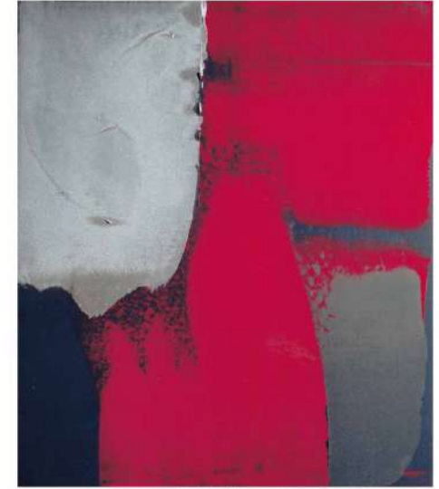
Untitled 2010 , acrylic on canvas. 28.6inx23.0in