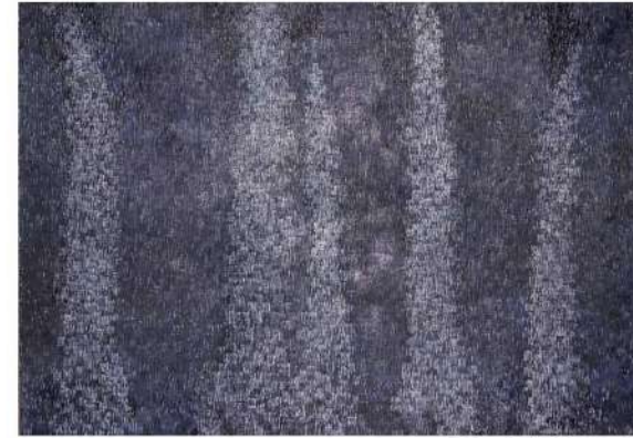
Water fall 2017 , mixmedia