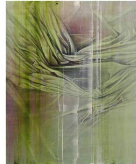
A long way 2018 ,oil, F80